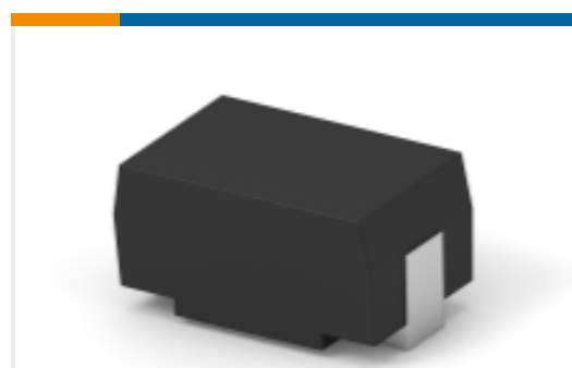
TE Part #6-1879233-5 SMD Power Resistor: 7 Watt, 200-2M Ohm