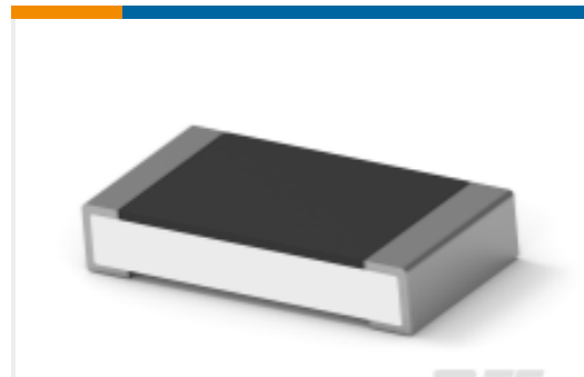
TE Part #9-2176389-4 RQ 1206 1K0 0.1% 10PPM 5K RL