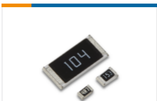
TE Part #6-2176341-1 CRGCO 0805 1M0 1%