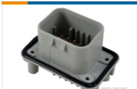
TE Part #1-776262-4 14 POS AMPSEAL VERTICAL HDR