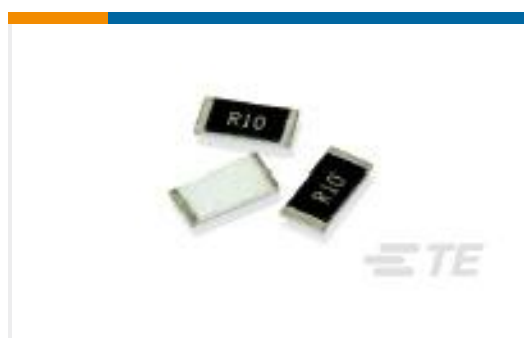
TE Part #1-2176052-9 RLP73N 1J R30 5% 5K RL