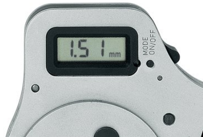
multi-functional digital display, adjustment in mm, inch or comparable selection positions according to MIL