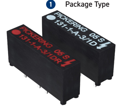
Text color option