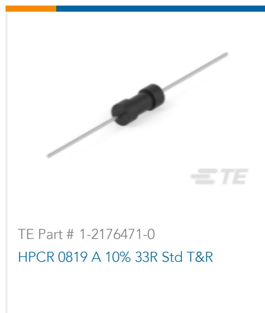
TE Part # 1-2176471-0 HPCR 0819 A 10% 33R Std T&R