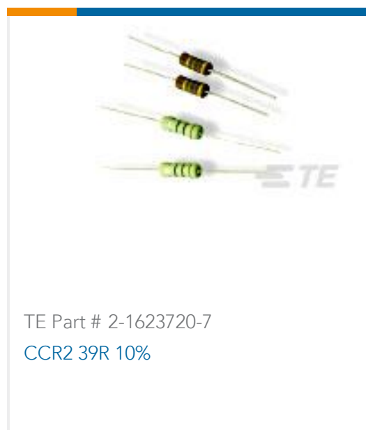
TE Part # 2-1623720-7 CCR2 39R 10%