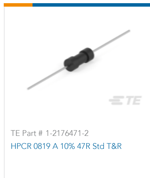
TE Part # 1-2176471-2 HPCR 0819 A 10% 47R Std T&R