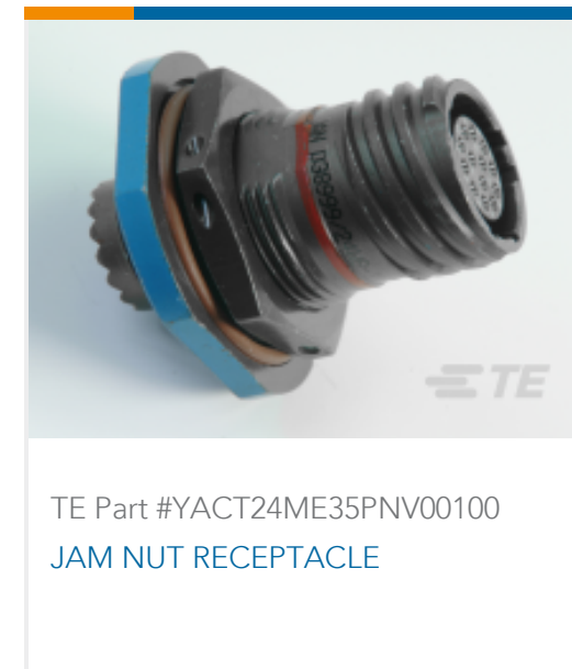
TE Part #YACT24ME35PNV00100 JAM NUT RECEPTACLE