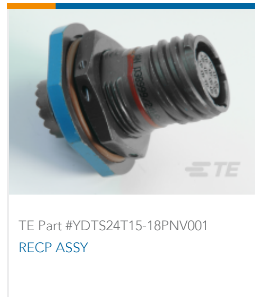
TE Part #YDTS24T15-18PNV001 RECP ASSY