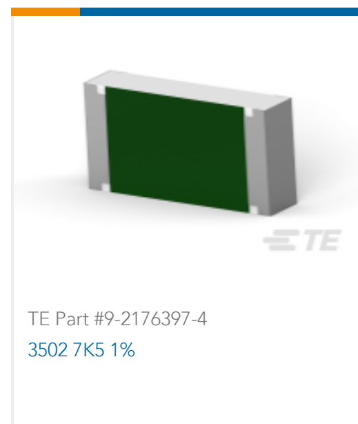
TE Part #9-2176397-4 3502 7K5 1%