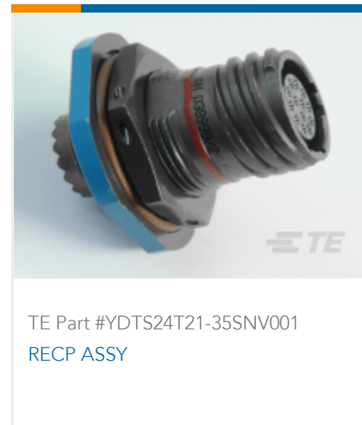
TE Part #YDTS24T21-35SNV001 RECP ASSY