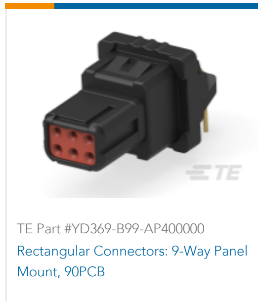
TE Part #YD369-B99-AP400000 Rectangular Connectors: 9-Way Panel Mount, 90PCB