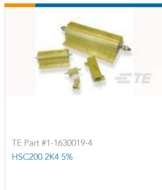
TE Part #1-1630019-4 HSC200 2K4 5%