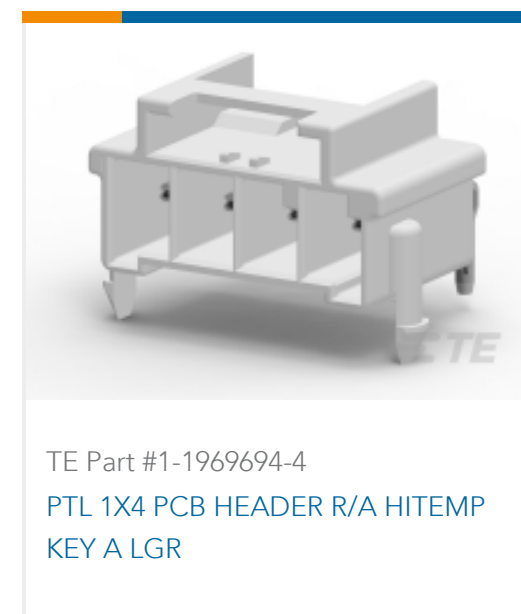
TE Part #1-1969694-4 PTL 1X4 PCB HEADER R/A HITEMP KEY A LGR