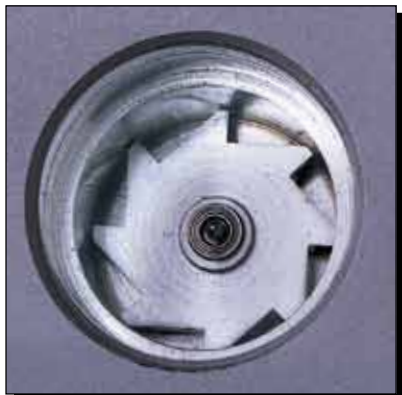
Pelton-type rotor is well suited to high head, low flow applications.