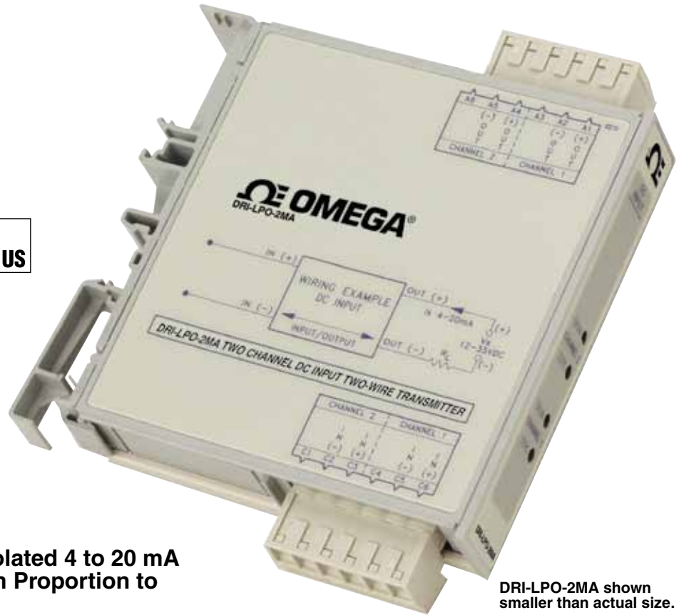
DRI-LPO-2MA shown smaller than actual size.