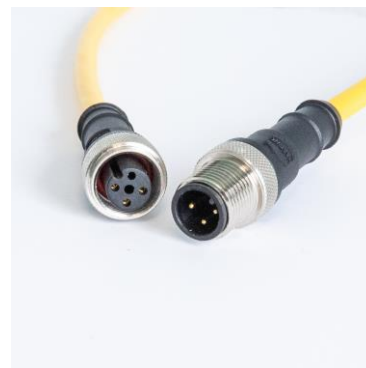
Male and Female 3-pole