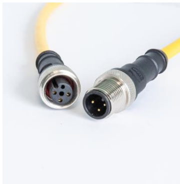
Male and Female 3-pole