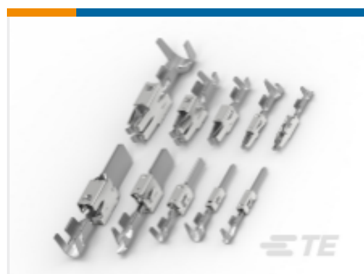
TE Part # CAT-T4827-T273 TIMER, RECEPTACLE AND TAB