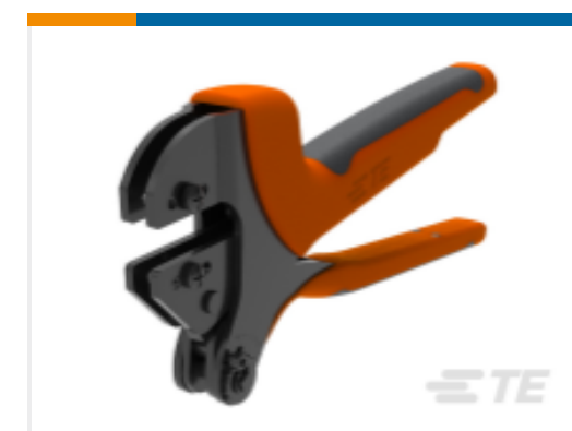
TE Part # 2362810-1 SDE CRIMP HAND TOOL FRAME W /O DIES