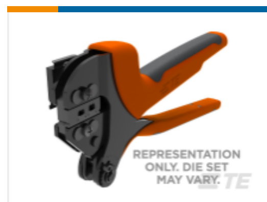
TE Part # 2390277-1 SDE F JR PWR TIMER 1.50-2.50mm2 ASSY