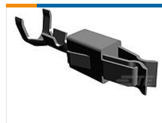
TE Part # 964287-2 JPT A REC 2.8 Contact SWS Sn (LP)