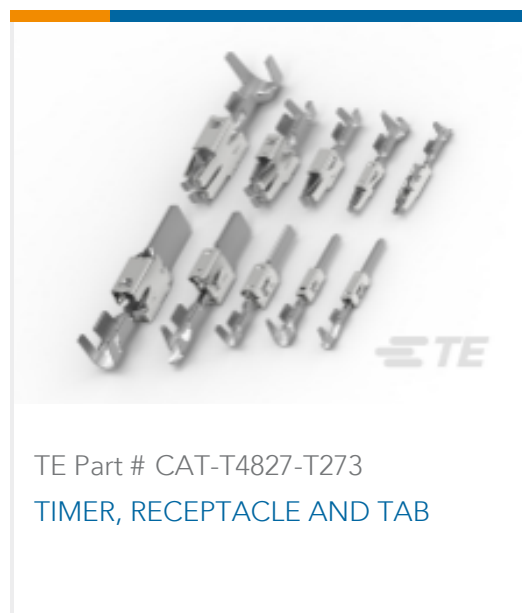
TE Part # CAT-T4827-T273 TIMER, RECEPTACLE AND TAB