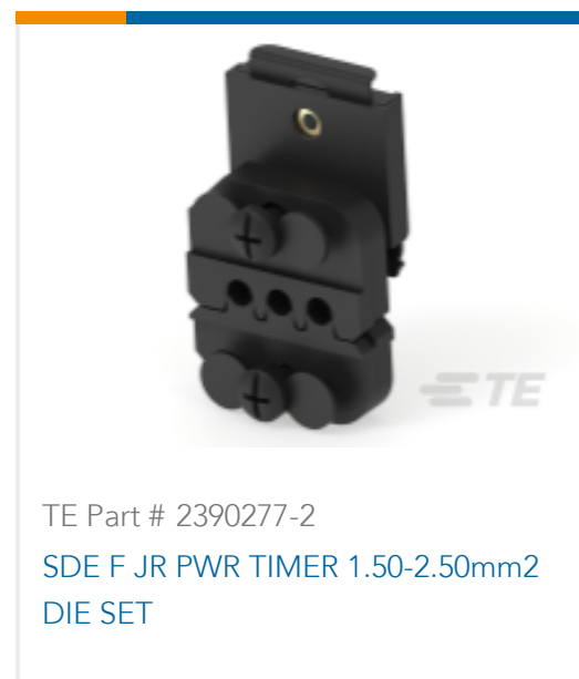
TE Part # 2390277-2 SDE F JR PWR TIMER 1.50-2.50mm2 DIE SET