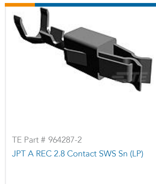
TE Part # 964287-2 JPT A REC 2.8 Contact SWS Sn (LP)