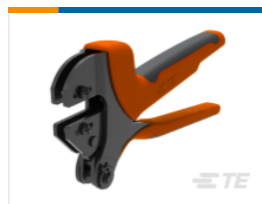
TE Part # 2362810-1 SDE CRIMP HAND TOOL FRAME W /O DIES