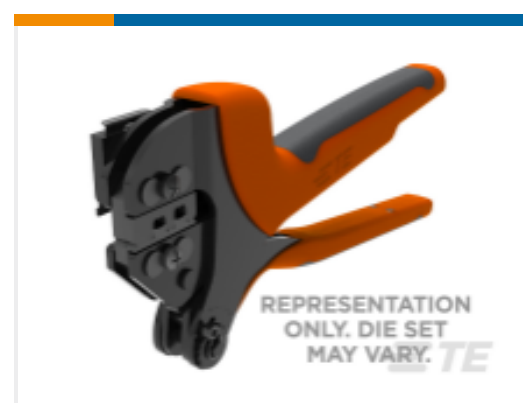
TE Part # 2392945-1 SDE F FLAT CONTACT 1.5-2.5mm2 ASSY