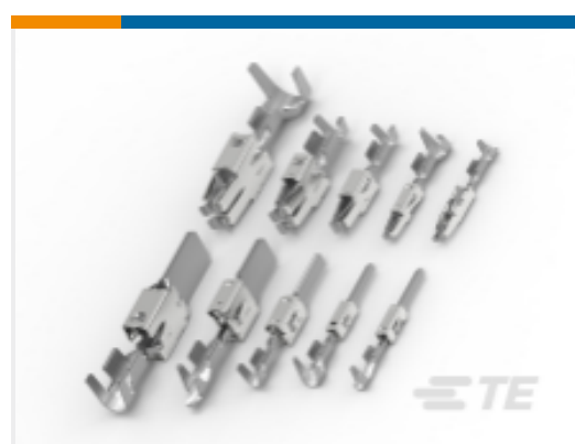
TE Part # CAT-T4827-T273 TIMER, RECEPTACLE AND TAB