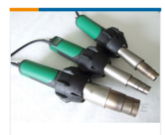
TE Part # EG1116-000 CV1981-ST-230V1600W-UK