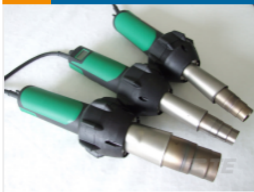
TE Part # EG1116-000 CV1981-ST-230V1600W-UK