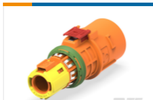
TE Part #2399663-8 Pre-ASSY,Finger Access,Code H