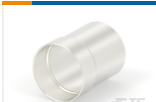
TE Part #2387548-1 CU ALLOY,OUTER FERRULE