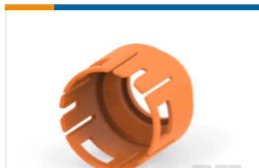
TE Part #2399669-3 H&S 120mm, Cable cover