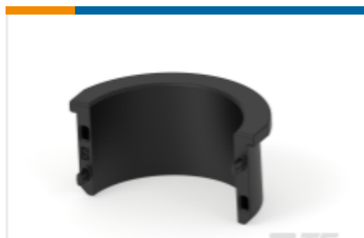
TE Part #2399666-3 H&S 120mm, Inner spcaer