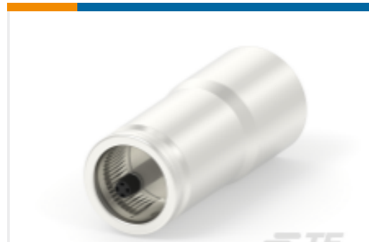
TE Part #2386340-2 DIA 14MM,TERMINAL,FAM SLD /UNSLD,CB