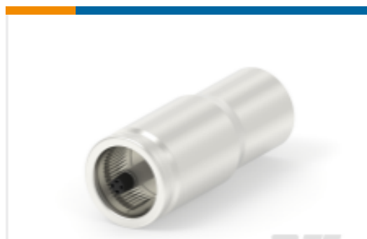
TE Part #2386340-1 DIA 14MM,TERMINAL,FAM SLD /UNSLD,CB