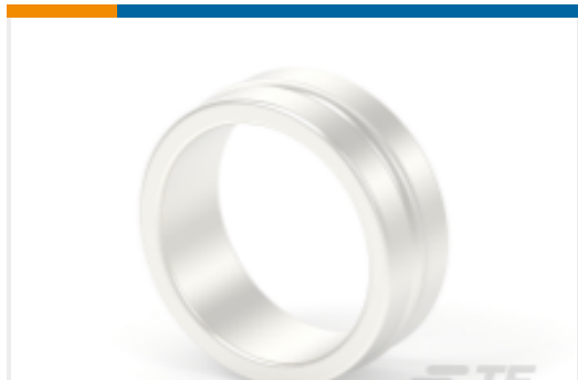
TE Part #2387549-3 CU ALLOY,INNER FERRULE,120SQ