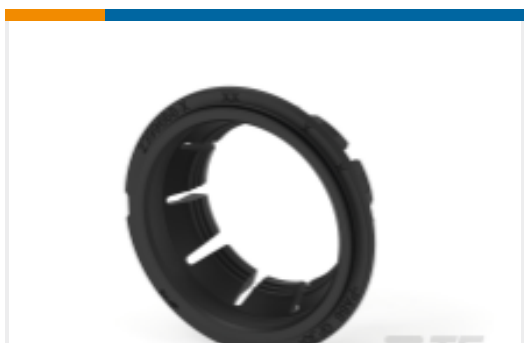
TE Part #2399668-3 H&S 120mm, Cable clip