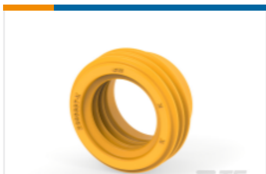
TE Part #2399667-3 H&S 120mm, SWS