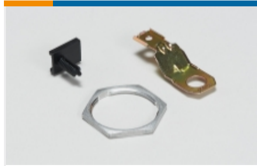
Other Automotive Connector Accessories(6)