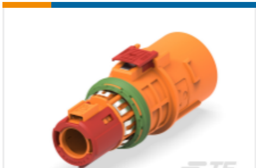
TE Part #2399663-7 Pre-ASSY,Finger Access,Code G