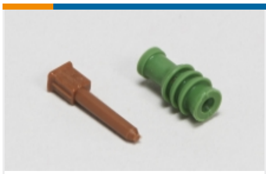
Automotive Seals & Cavity Plugs(3)