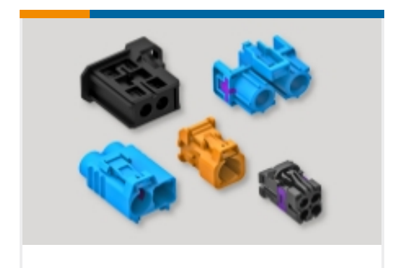
Data Connectivity Housings(18)