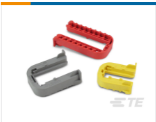
TE Part # CAT-H3399-SL34 Heavy Duty Sealed Connector Series Fixing Slides