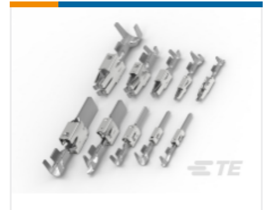
TE Part # CAT-T4827-T273 TIMER, RECEPTACLE AND TAB