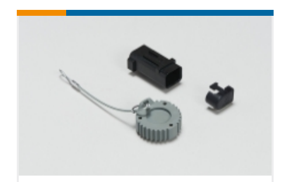
Automotive Connector Caps & Covers (25)