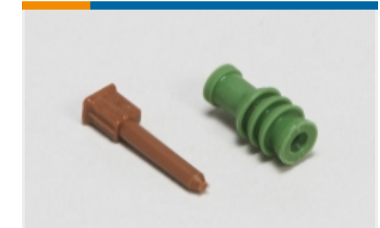
Automotive Seals & Cavity Plugs(5)