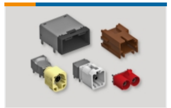
Data Connectivity Headers(2)