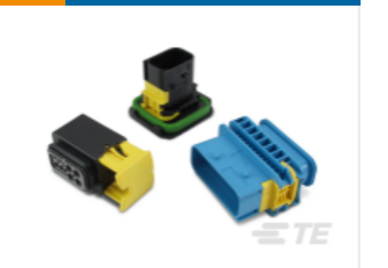
TE Part # CAT-H3399-CH8172 Heavy Duty Sealed Connector Series Housings