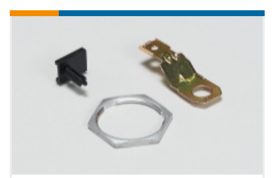
Other Automotive Connector Accessories(34)