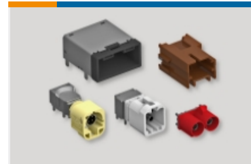
Data Connectivity Headers(2)