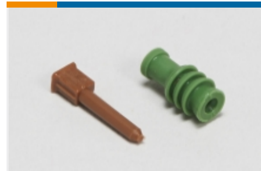
Automotive Seals & Cavity Plugs(5)