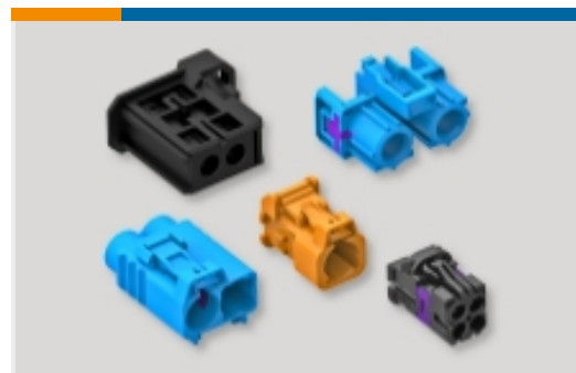
Data Connectivity Housings(18)