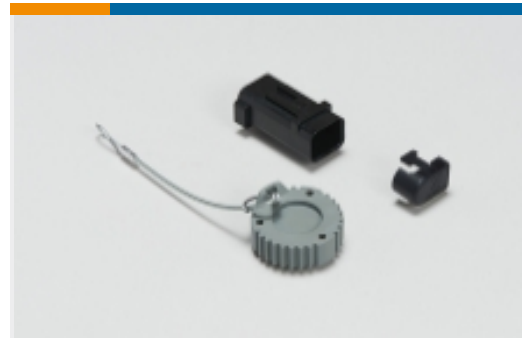
Automotive Connector Caps & Covers (25)