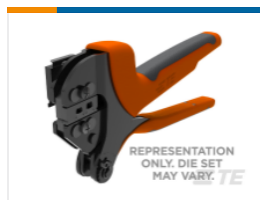
TE Part # 2393700-1 SDE F POWER TIMER 0.50-1.00 ASSY