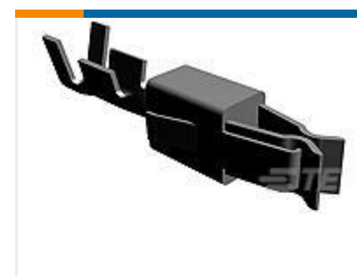
TE Part # 964283-2 JPT A REC 2.8 Contact SWS Sn (LP)