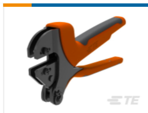
TE Part # 2362810-1 SDE CRIMP HAND TOOL FRAME W /O DIES