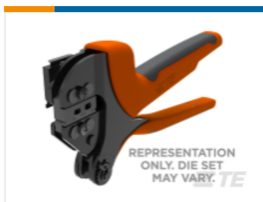
TE Part # 2390277-1 SDE F JR PWR TIMER 1.50-2.50mm2 ASSY