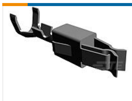
TE Part # 964287-2 JPT A REC 2.8 Contact SWS Sn (LP)