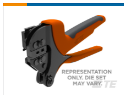
TE Part # 2392793-1 SDE F POWER CONTACT 22-50 O ASSY