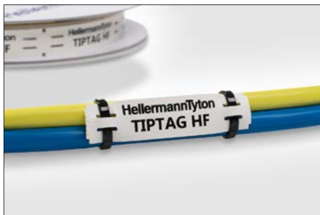
TIPTAG - high performance cable bundle marking.