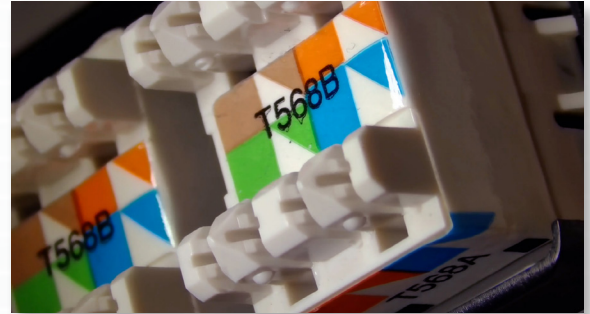
360 Viewer (View Objects at a 35 Degree Angle)