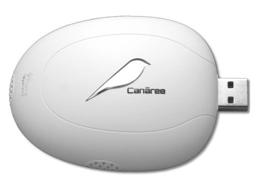
Figure 1 - Canaree AQM

Canāree is a compact Air Quality Monitor (AQM) that monitors air quality in real-time. A-Series models are USB-only devices that can be IoT enabled when connected to a networked device such as Wireless Access Points or any Windows PC / Mac running SenseiAQ Software. I-Series models support Wireless-LAN (using 2.4gz 802.11n) for standalone operation. Additional gas sensors are available depending on models including Biogenic Volatile Compounds (BVOC), temperature, relative humidity, pressure, and CO<sub>2</sub>. in the Canāree i5. Please refer to the product lineup section for more details.