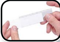
LTR-0813 Clear Label Holder and Insert Clear label holders and laser label inserts. Package of 25. Label holders fit all bins (except QSB100).