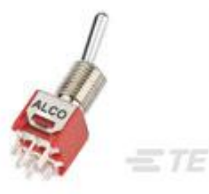
TE Part #2267077-1 TMS1T4B5M2RE