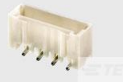
TE Part #292231-3 1.5 MINI CT SGL V SMT W/O BOSS