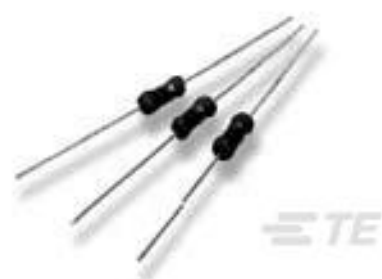
TE Part #9-1879352-1 RR02 5% 1K8 AMMO