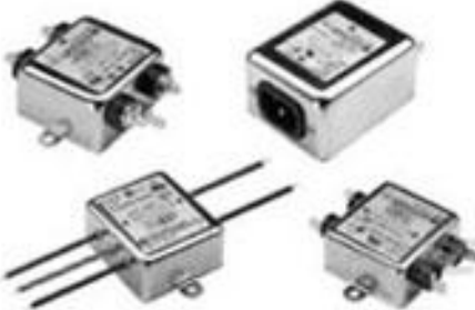
TE Part #1-6609027-5 10EK7=F7095 S0