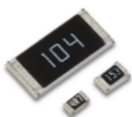
TE Part #2176347-6 CRGCO 2010 27R 1%