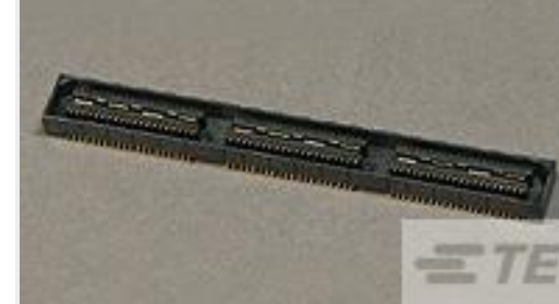
TE Part #2-1658012-3 MSB0.80RC-ASY120FL,-,10,-TY