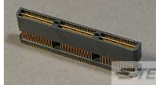
TE Part #1658017-3 MSB0.80PL19ASY120FL,-,10,-TY