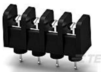
TE Part # 1776858-6 SSB7TP060101=TERM BLOCK ASSY