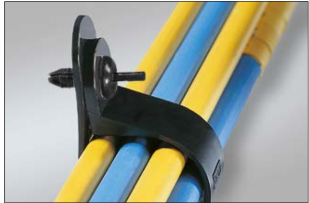
Plastic Rivet TY8P1 in application.