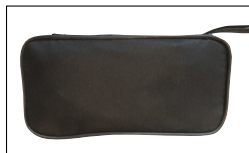
Carrying case supplied as standard

Supplied with : Instruction manual, Test leads (4mm), 2 x 1.5V AAA batteries, Carrying case.