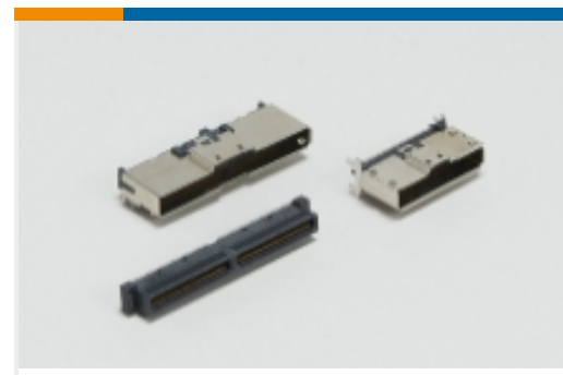
Internal I/O Connectors(135)