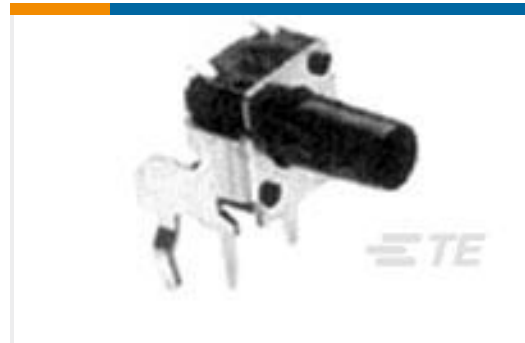
TE Part #1-1825027-1 FSMRA4JH04=R/A,TACT PB SW,160G