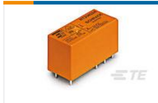
TE Part #4-1415536-2 RTHH4012WG