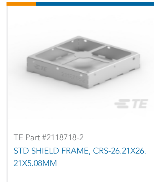
TE Part #2118718-2 STD SHIELD FRAME, CRS-26.21X26.21X5.08MM