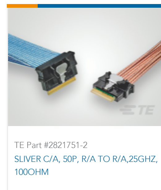
TE Part #2821751-2 SLIVER C/A, 50P, R/A TO R/A, 25GHZ, 100OHM