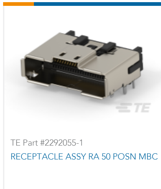
TE Part #2292055-1 RECEPTACLE ASSY RA 50 POSN MBC