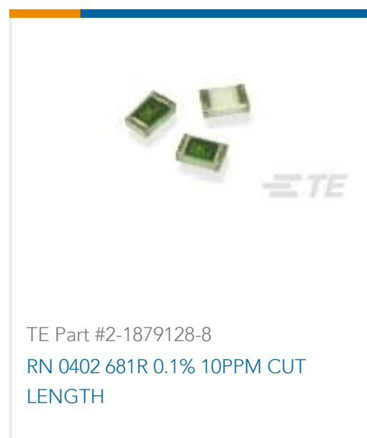
TE Part #2-1879128-8 RN 0402 681R 0.1% 10PPM CUT LENGTH