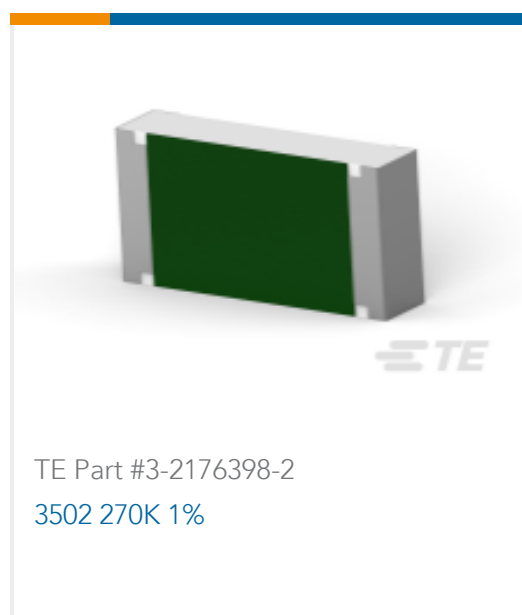
TE Part #3-2176398-2 3502 270K 1%