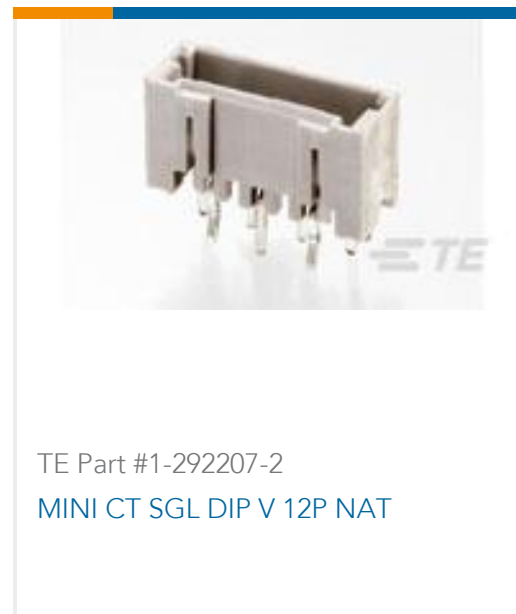
TE Part #1-292207-2 MINI CT SGL DIP V 12P NAT