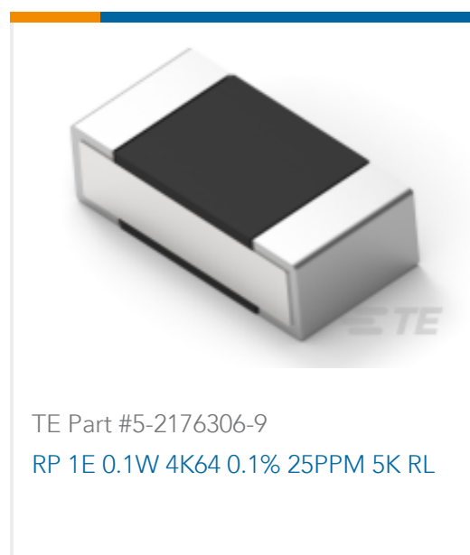
TE Part #5-2176306-9 RP 1E 0.1W 4K64 0.1% 25PPM 5K RL