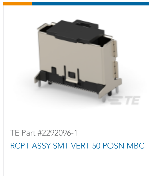
TE Part #2292096-1 RCPT ASSY SMT VERT 50 POSN MBC