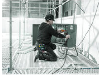
Screwdriver sets in belt holster