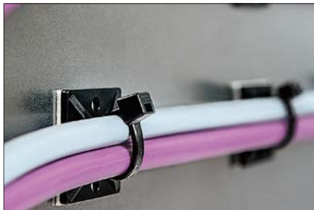
MB-Series Mounts with square design.