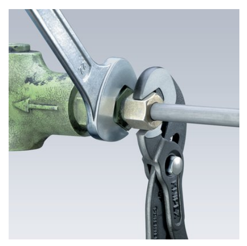
Self-locking: no slip on workpieces; less effort required