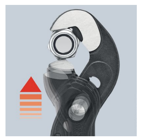
Fine adjustment by pushing a button: fast and comfortable.