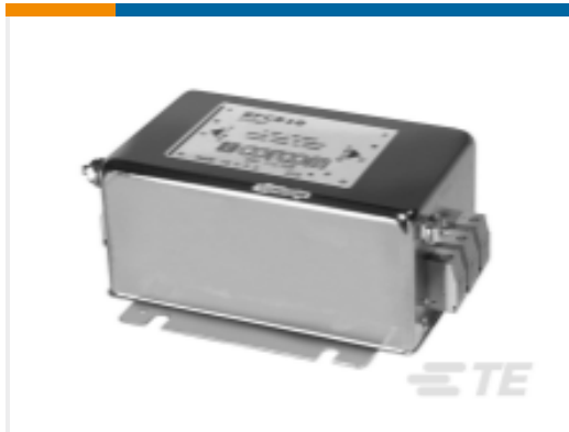
TE Part #6609070-6 Corcom 3-Phase Filters, FCD Series