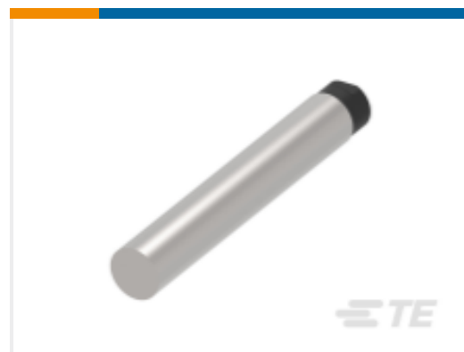
TE Part #076-10005-10 ML-11 TEMP. SENSOR 10 FT