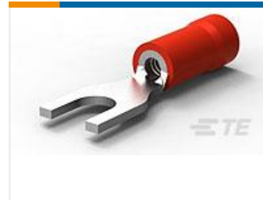
TE Part #327043 PG SPD 22-16 COMM 22-18 MIL 6