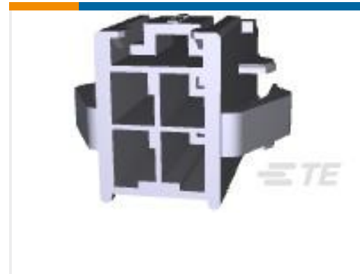
TE Part #177908-1 POWER DBL LOCK CAP HSG P/M 4P