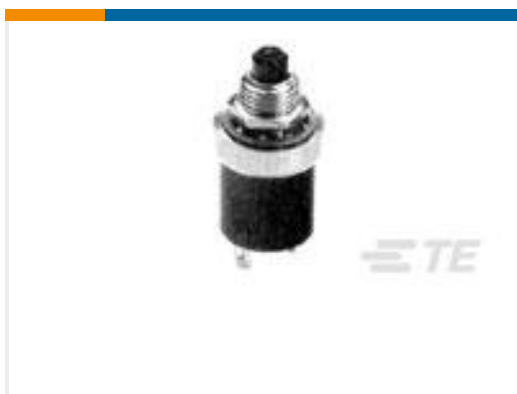
TE Part #1825516-2 MSP103C04