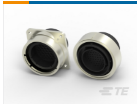
TE Part #208720-1 Circular Plastic Connector, CMC Series 1