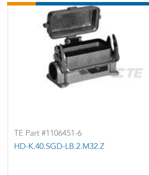
TE Part #1106451-6 HD-K.40.SGD-LB.2.M32.Z