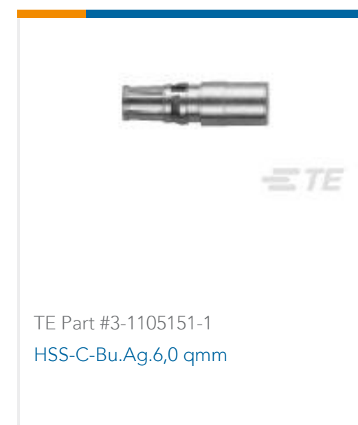
TE Part #3-1105151-1 HSS-C-Bu.Ag.6,0 qmm