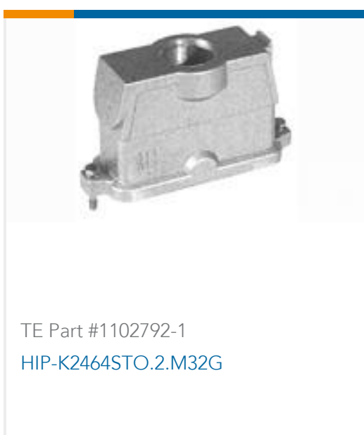
TE Part #1102792-1 HIP-K2464STO.2.M32G