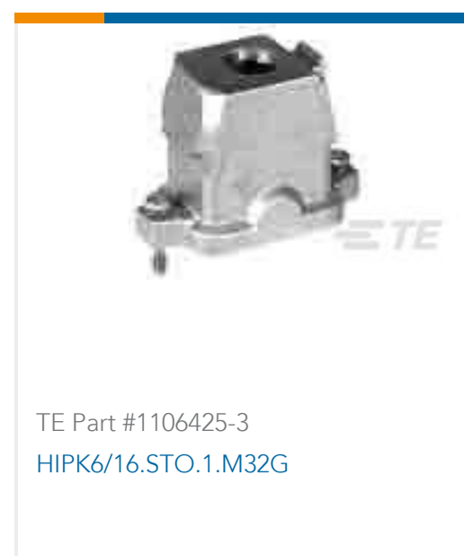
TE Part #1106425-3 HIPK6/16.STO.1.M32G