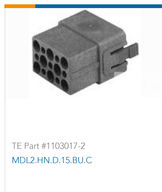
TE Part #1103017-2 MDL2.HN.D.15.BU.C