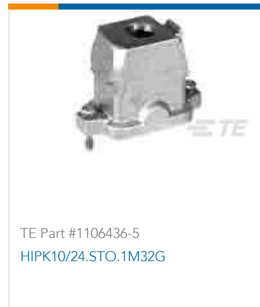
TE Part #1106436-5 HIPK10/24.STO.1M32G