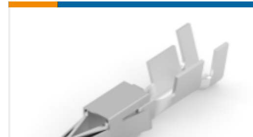
TE Part #927777-3 JUNIOR POWER TIMER CONTACT