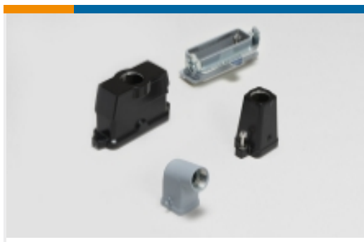
Rectangular Connector Hoods & Bases (1258)