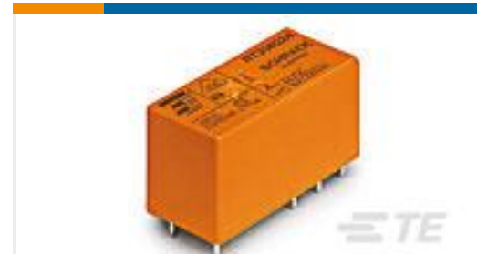
TE Part #1-1393240-1 RT315012