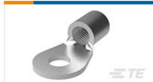
TE Part #160001 TERM,SOLIS R 2/0 M10