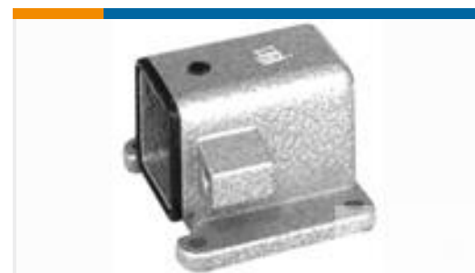
TE Part #4-1102702-5 EMV-K.3/4.SGF