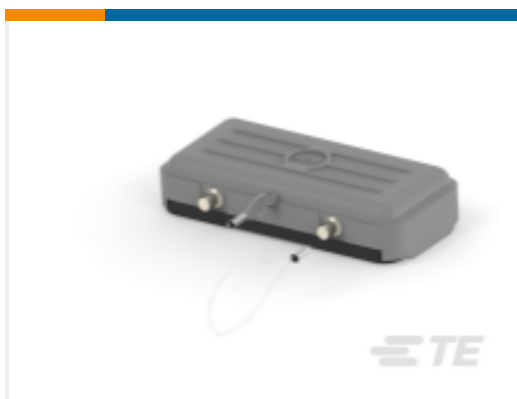
TE Part #T1010161600-000 H16B-KDTP-BO