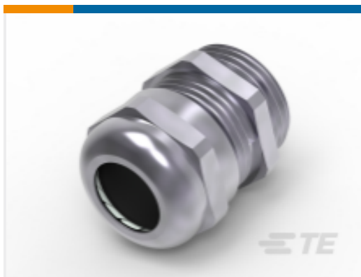
TE Part #T3609200102-000 DLX-20-M