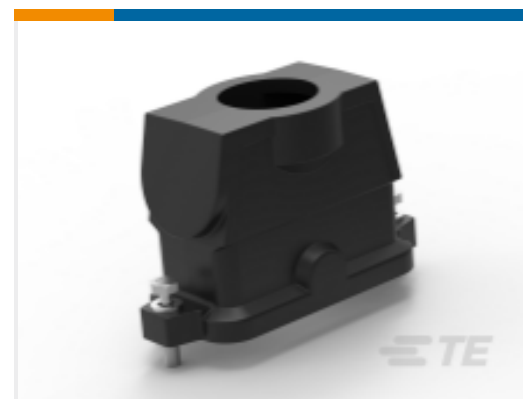
TE Part #T1922160140-000 H16BPR-TGHC-M40