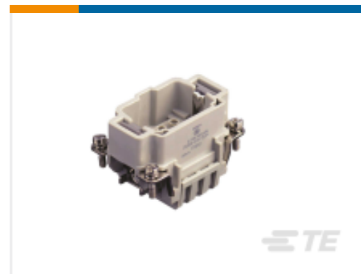
TE Part #T2040064101-000 HE-006-MC