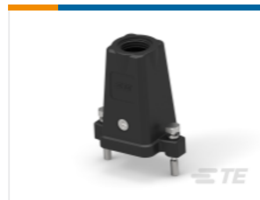
TE Part #T1926030116-009 H3APR-TGC-M16-EMC-C