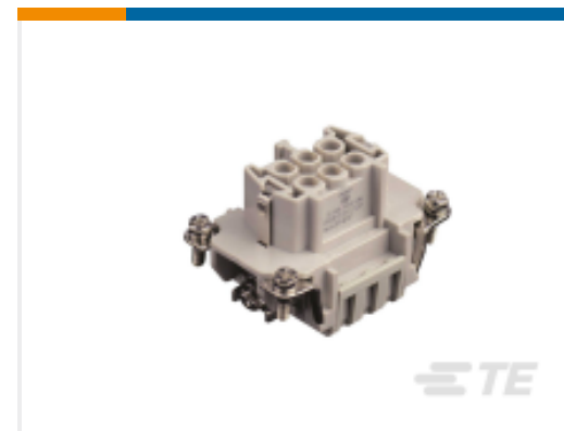
TE Part #T2040064201-000 HE-006-FC