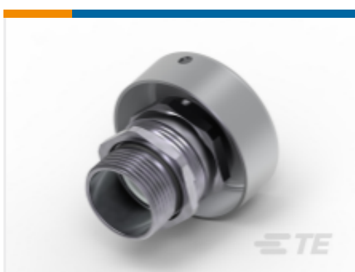
TE Part #T3900250250-000 M25X1.5 VA-25-LM