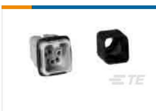
TE Part #2-1103102-3 HN.D.7.STI.C