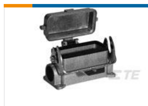
TE Part #1106451-6 HD-K.40.SGD-LB.2.M32.Z