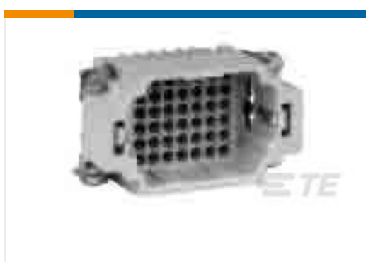
TE Part #2-1103204-3 HN.2D.42.STI.C