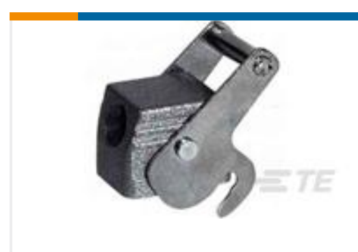
TE Part #2-1102240-7 HB-K.6.STS.1.16.G