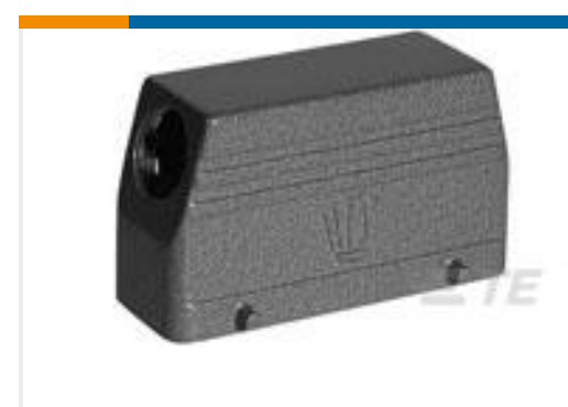
TE Part #1106465-4 HB.24.STS.1.M32.G