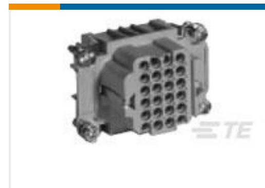
TE Part #2-1103202-3 HN.2.D.24.BU.C.