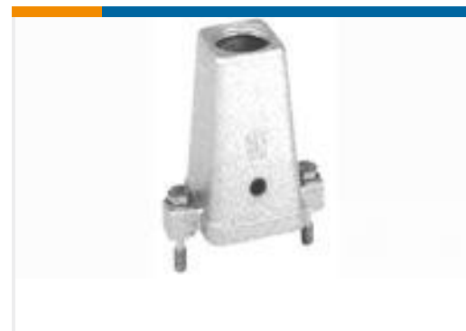
TE Part #1106408-2 HIP-K.3/4.STO.1.M16.G