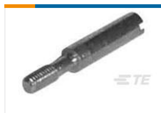
TE Part #1-1106101-1 F-BU-M3