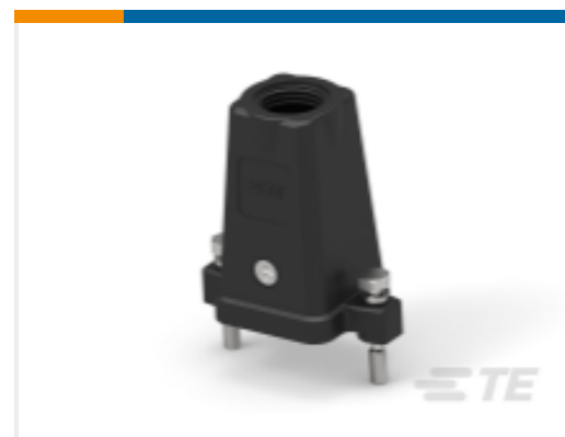
TE Part #T1926030116-009 H3APR-TGC-M16-EMC-C