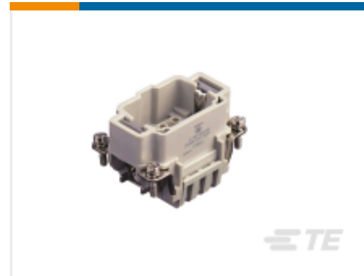
TE Part #T2040064101-000 HE-006-MC