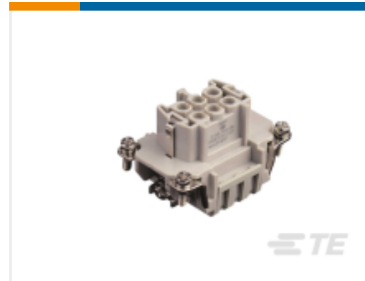
TE Part #T2040064201-000 HE-006-FC