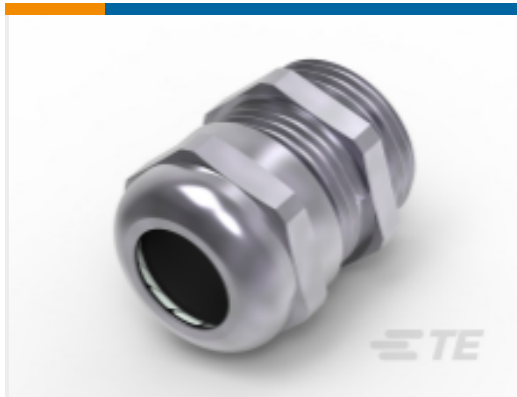
TE Part #T3609200102-000 DLX-20-M