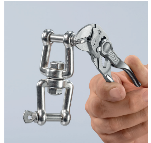
The Pliers Wrench XS features a high lever transmission ratio which allows it to grip, press and hold material tightly