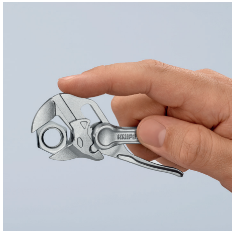
One-handed adjustment by simply sliding the handle