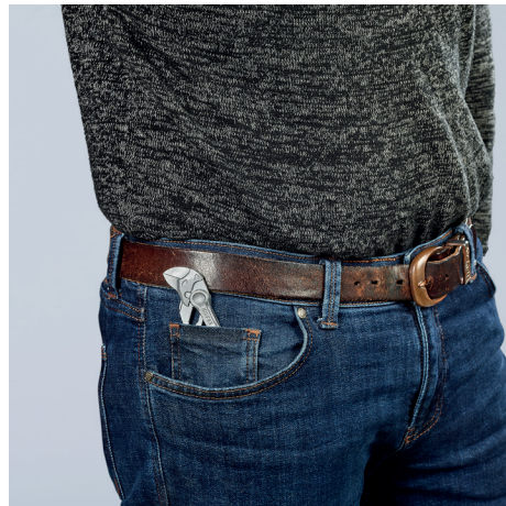
Small enough to fit in your pocket for EDC (every day carry)