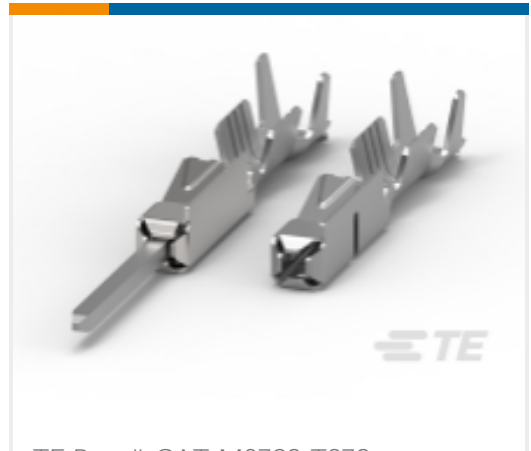
TE Part # CAT-M8793-T273 MQS, RECEPTACLE AND TAB