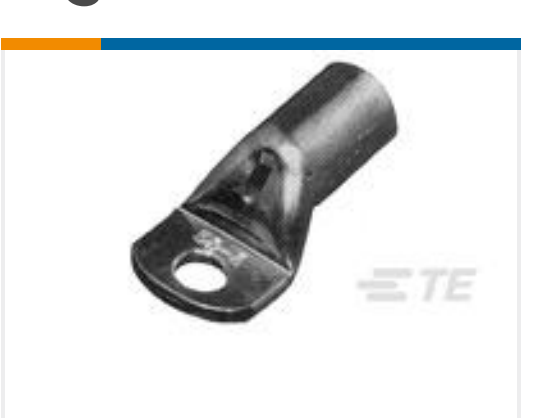
TE Part #709819-5 XCT 95-12