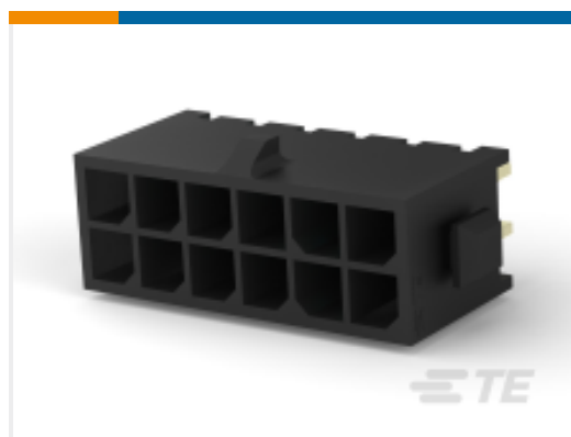
TE Part #2029304-1 12P MICRO MNL ASSY,VRT,HDR ON