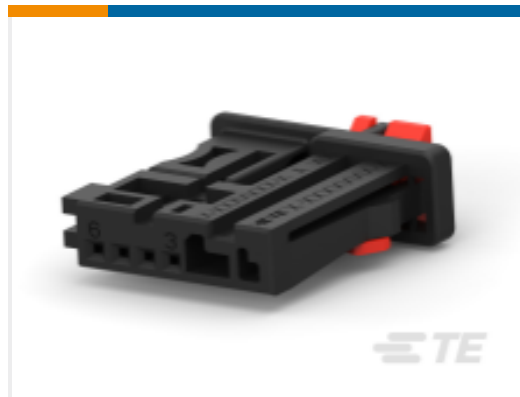
TE Part # 2333104-1 4POS,NANOMQS,REC HSG ASSY, COD A