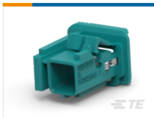
TE Part #2302510-9 1-PORT MATENET FRAME,STP, COD Z