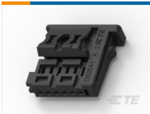
TE Part # 2282154-1 6POS,NANOMQS,REC HSG,CODA