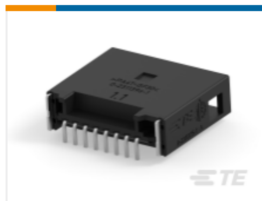
TE Part #2311396-1 8POS,TAB0.5X0.4,HDR ASSY,180DEG, COD A