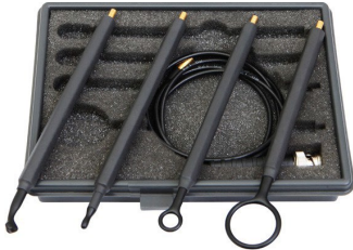
N9311X-100 (Near field probes)