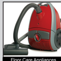
Floor Care Appliances