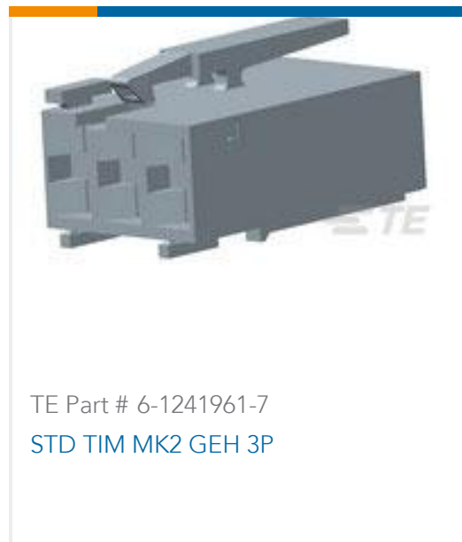
TE Part # 6-1241961-7 STD TIM MK2 GEH 3P