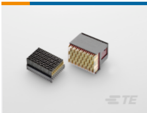
TE Part #2302317-1 RA ASSY, 7 Row, Cent DP, MULTIGIG RT 2-S