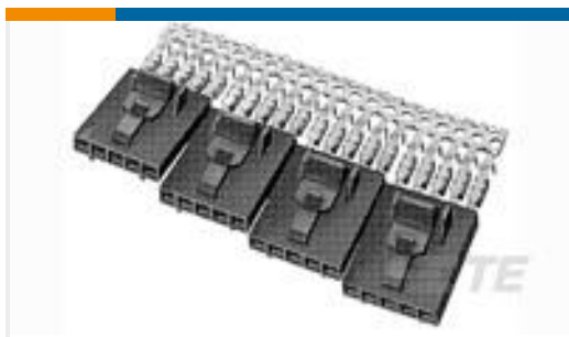
TE Part #1-103957-3 8X3 MTE RCPT SR LATCH .100CL