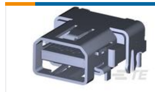
TE Part #2129320-3 Mini Displayport Reverse Offset