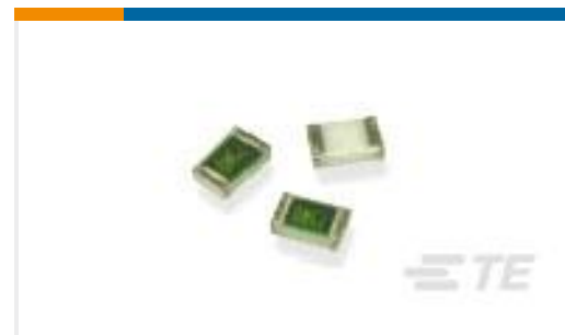
TE Part #7-2176087-4 RP 1J 0.166W 402R 0.1% 25PPM 1K RL