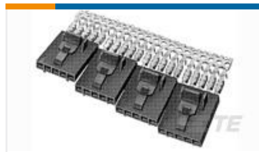
TE Part #103957-4 4X5 MTE RCPT SR LATCH .100CL