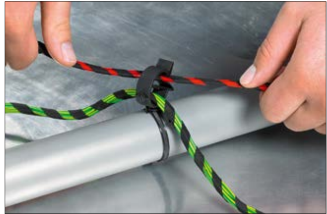
Pipe Clip CBTO, twistable 90°.