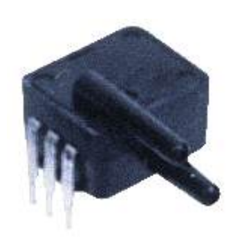
Representative photograph, actual product appearance may vary.

Due to regional agency approval requirements, some products may not be available in your area. Please contact your regional Honeywell office regarding your product of choice.