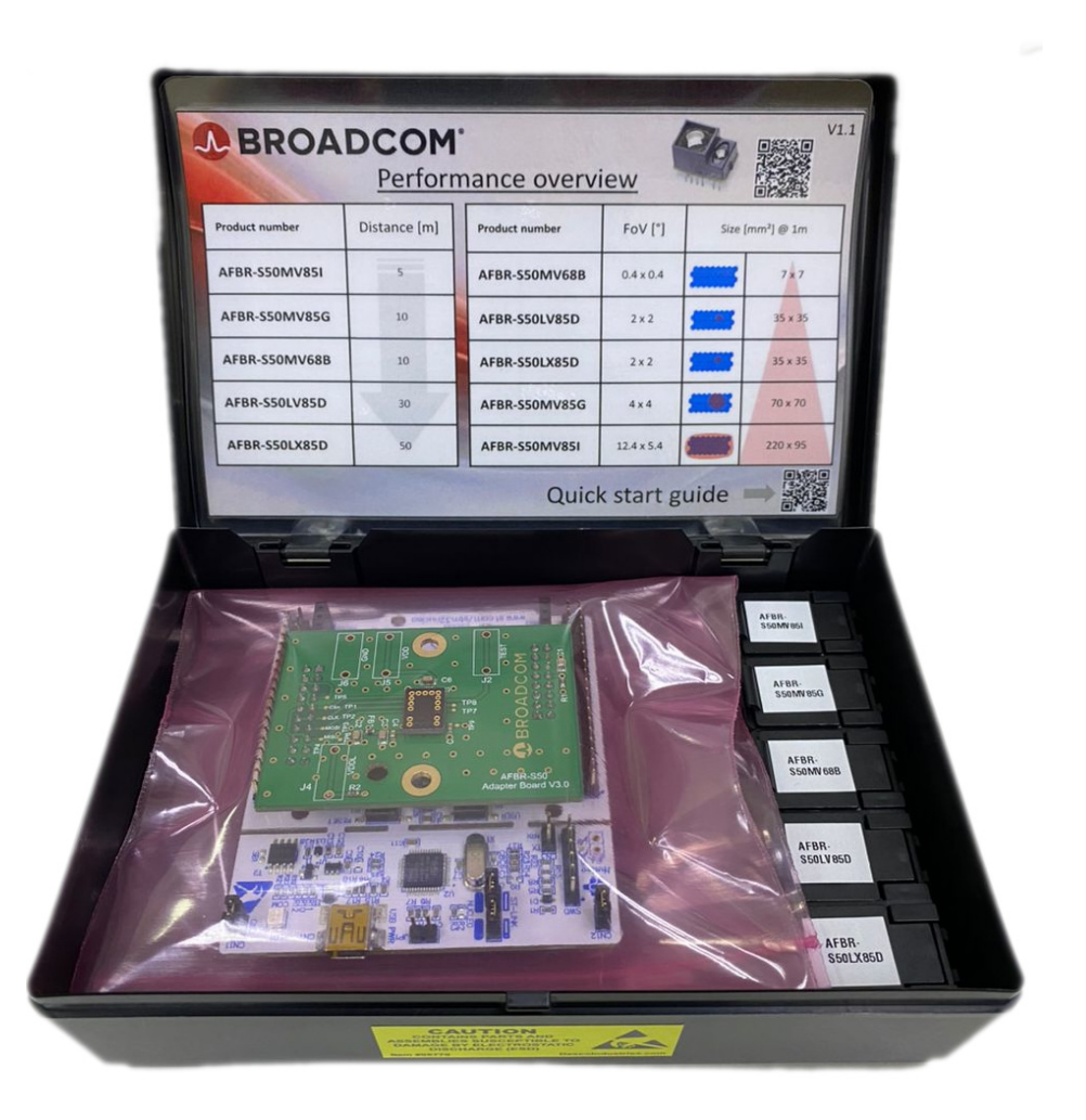
Figure 1: Evaluation Kit Components