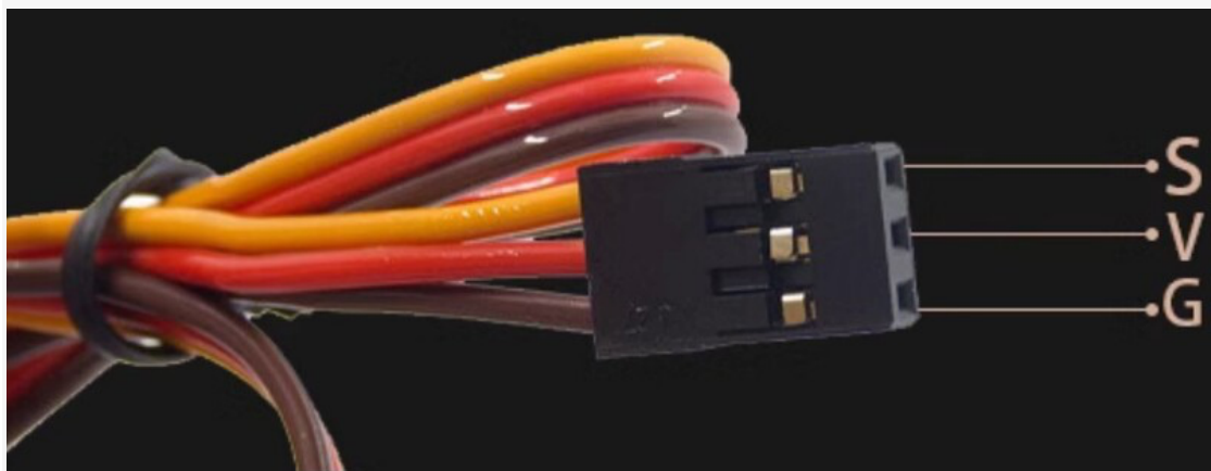
Interface Definition Diagram