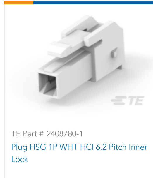
TE Part # 2408780-1 Plug HSG 1P WHT HCI 6.2 Pitch Inner Lock