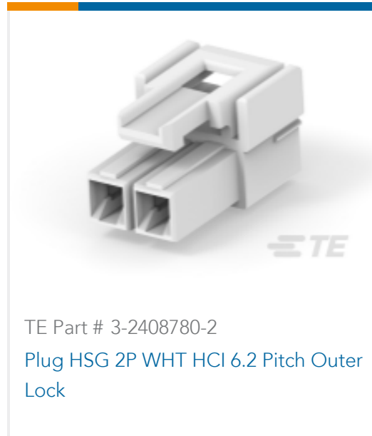
TE Part # 3-2408780-2 Plug HSG 2P WHT HCI 6.2 Pitch Outer Lock